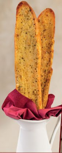
S2 Freshly Baked Garlic Loaf