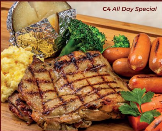
C4 All Day Special