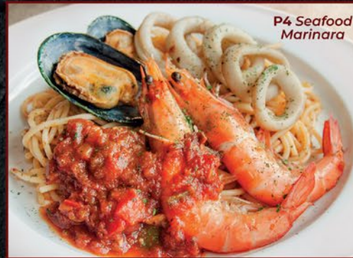
P4 Seafood Marinara