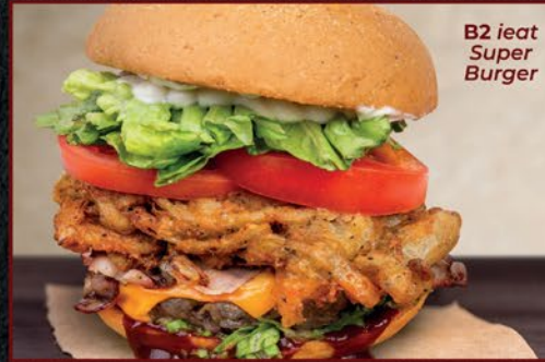
B2 ieat Super Burger