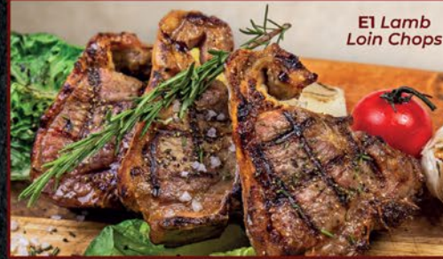
E1 Lamb Loin Chops