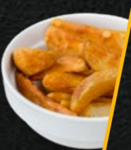
D3 Potato Wedges