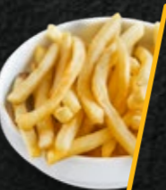
D4 French Fries