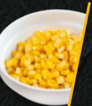
D9 Corn Niblets