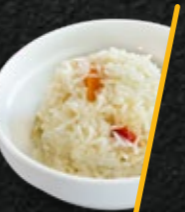
D5 Tasty Rice