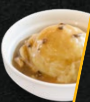
D2 Mashed Potato