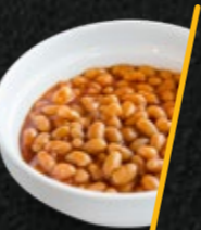
D8 BBQ Beans