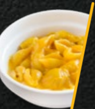
D6 Mac & Cheese