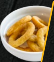
D7 Onion Rings