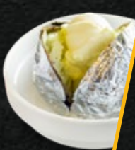
D1 Baked Potato