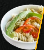
D13 Pasta Salad