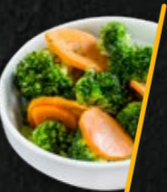
D10 Garden Veggie