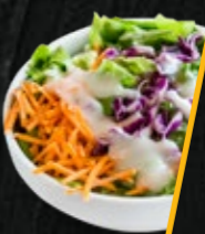
D12 House Salad