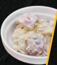
D14 Potato Salad